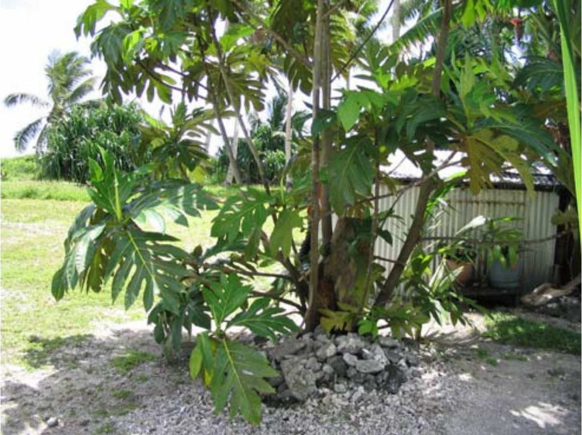
Tiang a meduu.