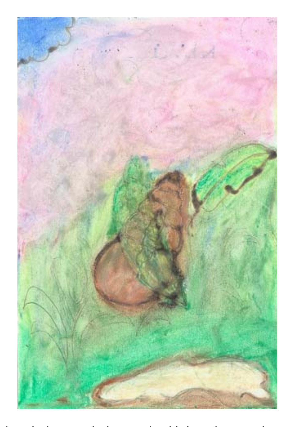
Next, he tried to patch the crack with long banana leaves. Still it did not work. The wind kept blowing them off.